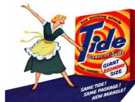
( plot - advertisement)