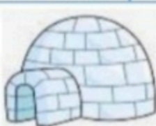
( igloo - cottage)