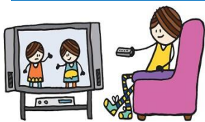
(version - TV show)