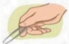
( trekking - tweezers )