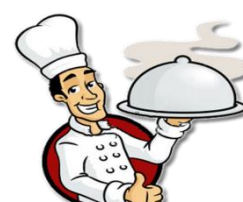
( reporter - chief)