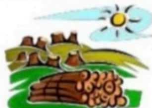
( cozy - deforestation )