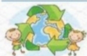
conservation - ranger)