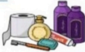
( surface - toiletries )