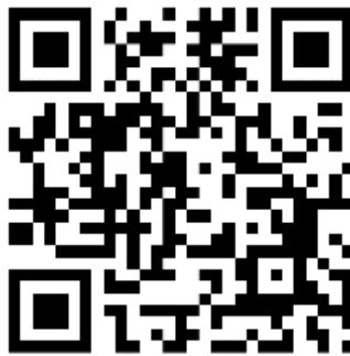
استماع 3 Super Goal

airport - subway station - football stadium .